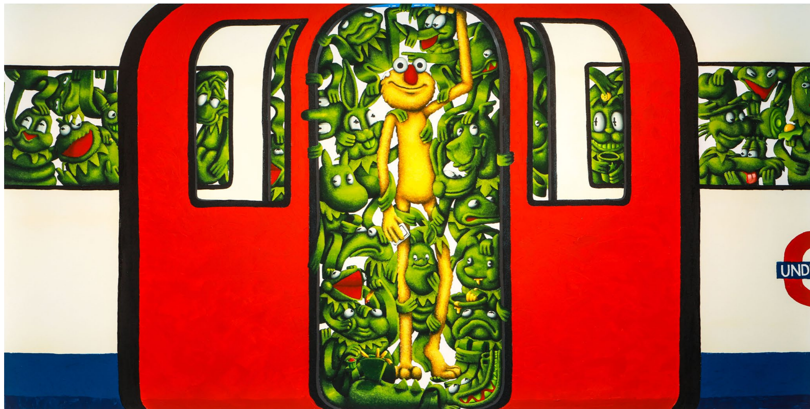
SEB CHAUMETON Mind the Platforms, 2018 (SC0072)

Acrylic, gouache and oil on canvas 143.5 CM x 285.5 CM