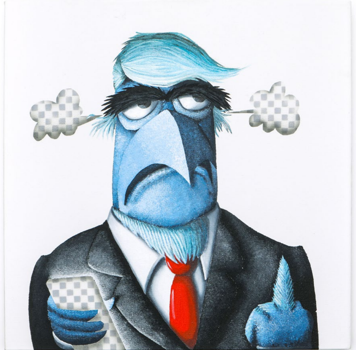
SEB CHAUMETON Bird Feed, 2019 (SC0080)

Acrylic, oil and airbrush on canvas 50 CM x 50 CM