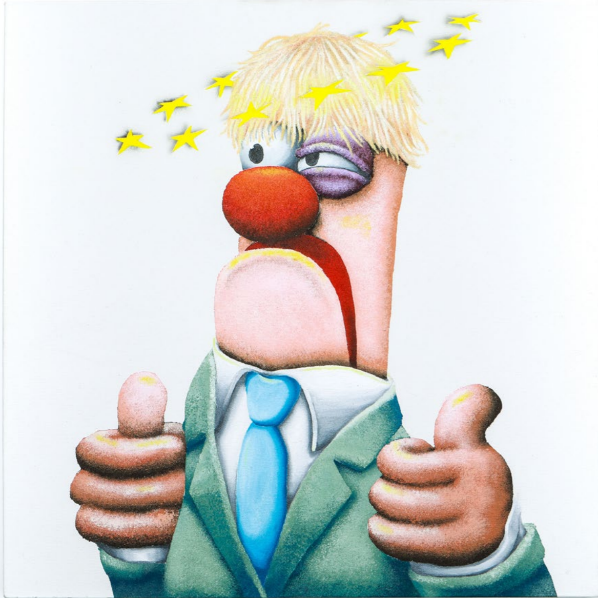
SEB CHAUMETON Beaker Boris, 2019 (SC0079)