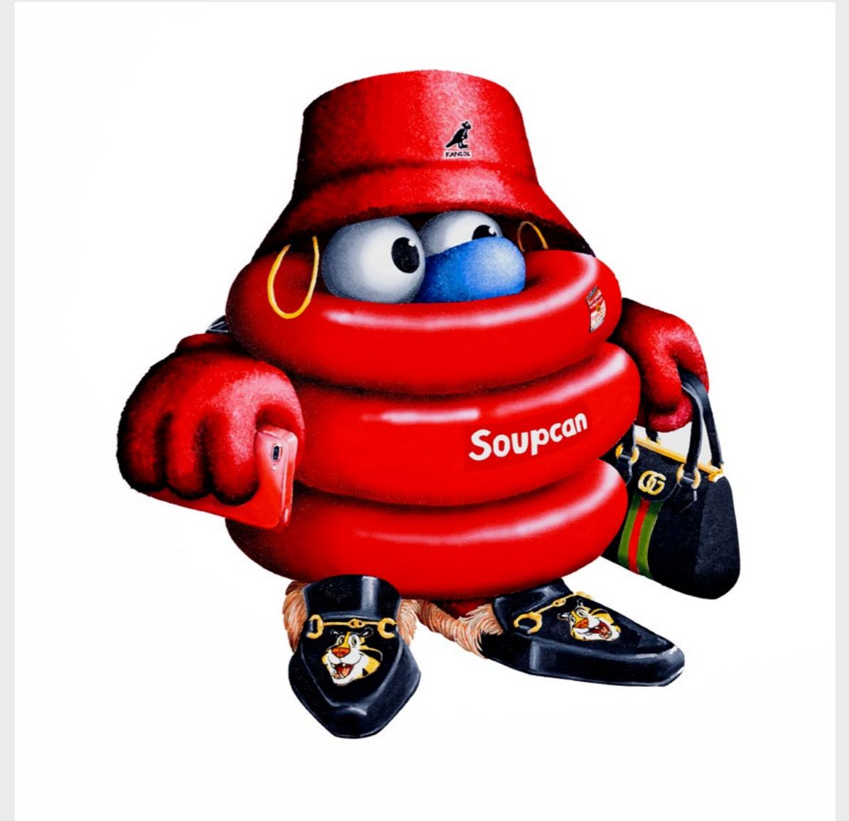
SEB CHAUMETON Souperfluous Diptych, 2019 (SC0076)

Acrylic, oil and airbrush on canvas 70 CM x 70 CM