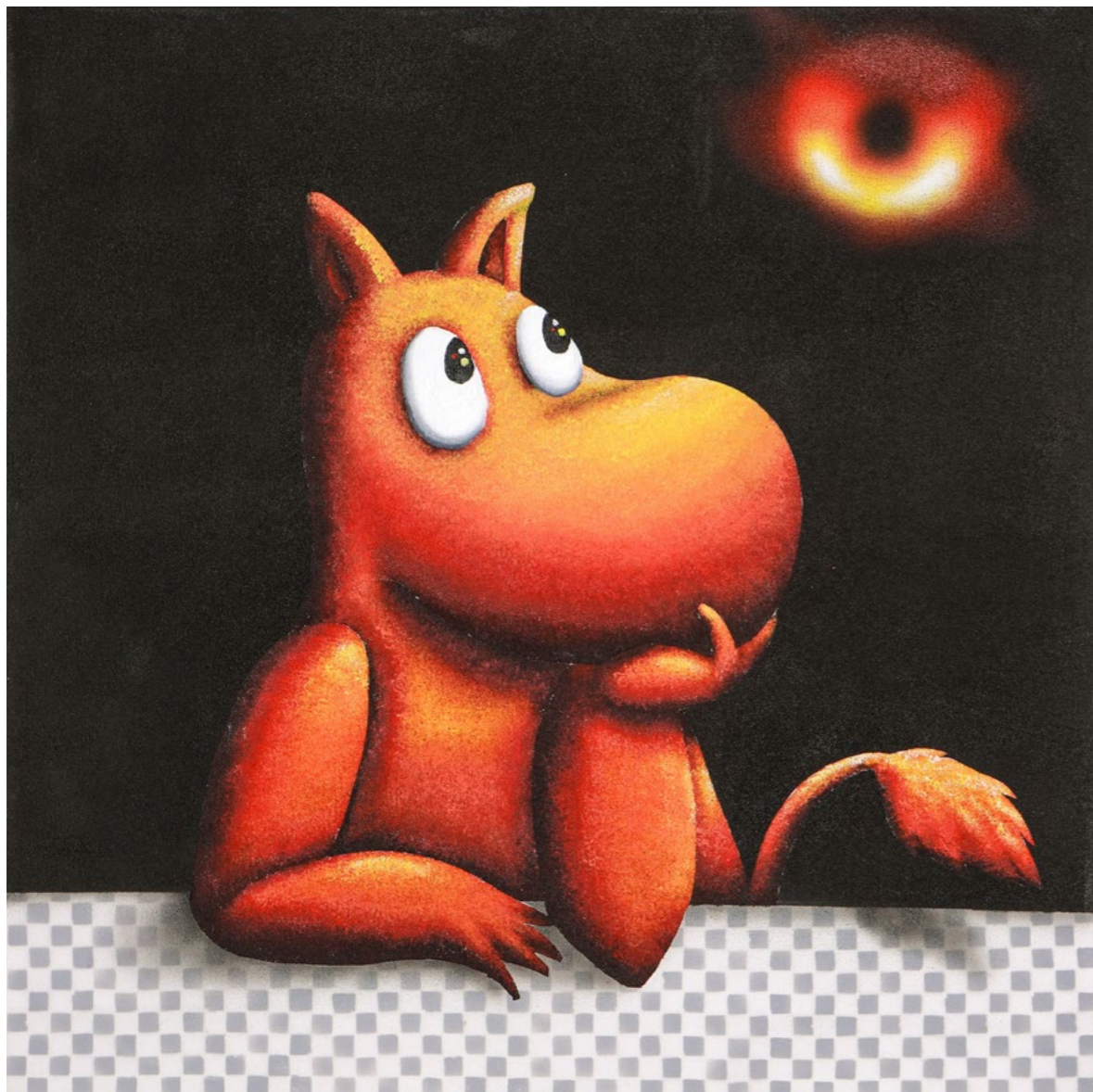
SEB CHAUMETON Moonspiracy, 2019 (SC0081)

Acrylic, oil and airbrush on canvas 50 CM x 50 CM