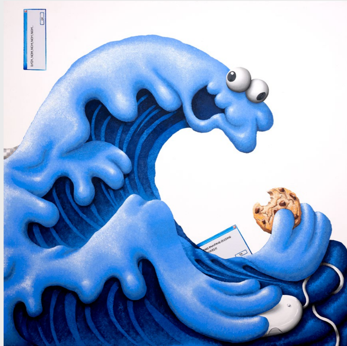
SEB CHAUMETON Hokusai's Monster, 2019 (SC0074)

Acrylic, gouache and oil on canvas 100 CM x 100 CM