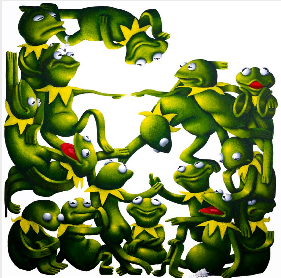
SEB CHAUMETON Kermit Overwhelming (SC0001)

Acrylic, gouache and oil on canvas 120 CM x 120 CM