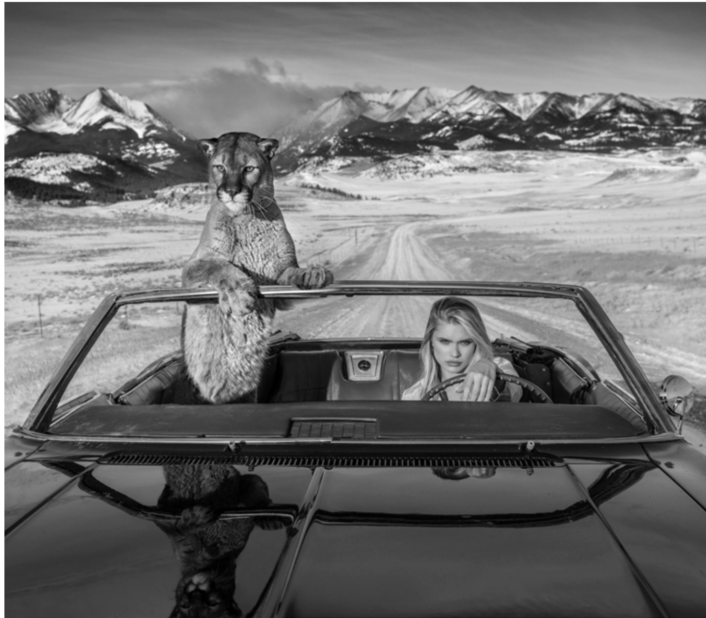
‘NO COUNTRY FOR OLD MEN’

EDITION OF 12/ EDITION OF 12 132 X 145CM/ 180 X 201CM 2019