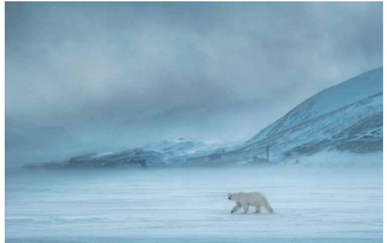
‘NORTH OF THE WALL’

EDITION OF 12/ EDITION OF 12 132 X 145CM/ 180 X 201CM 2019