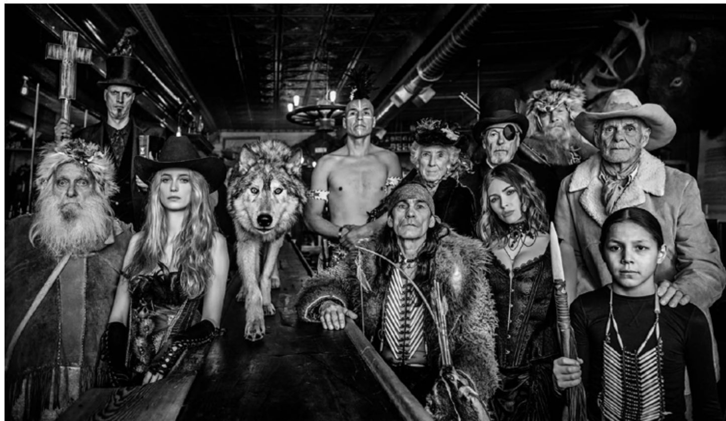
‘THE LAST CHANCE SALOON’

EDITION OF 12/ EDITION OF 12 132 X 201CM/ 180 X 300CM 2019